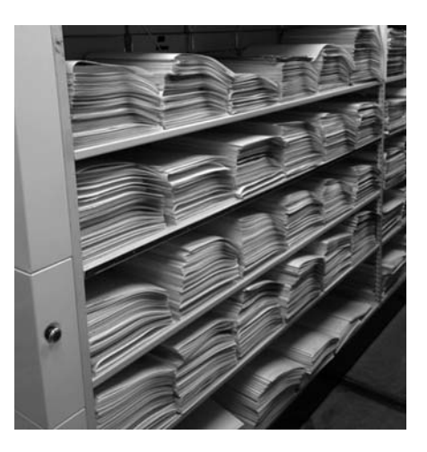
The Theodore Presser/Oliver Ditson collection

The Tams-Witmark collection is likewise a huge two-publisher archive. At one time this was the world's largest stage-musical-opera publisher, renting out music materials for Broadway shows and grand opera. But they also rented out complete sets and costumes – for example, for a Kern's Showboat or Verdi's Aida and shipped them all across the country via railroad box car.