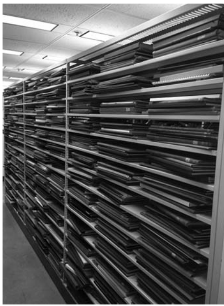
Folio range for oversize formats

Oversize formats are commonly produced for contemporary compositions and for conductor scores. Thousands of them, testifying to the vitality of modern music, are stacked sideways because they are too large for standard shelving.