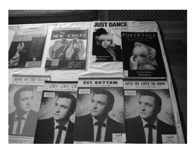
From the music treasures display

The site allows publishers to track their own statistics very easily. It allows the Agency manager to harvest detailed statistics and format them in ways useful to the Music Division, to the International Agency, to researchers, etc.