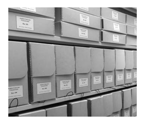
The Aaron Copeland collection

The complete catalogs of major music publishers are arranged by publisher number. Each piece is housed in an acid-free paper folder. When a part of the run is complete, the folders are boxed for off-site storage. This historic music is indexed in catalog listings which were maintained by the publishing houses and which are now are kept at LC. Currently, one must visit Washington, DC to use these catalogs,