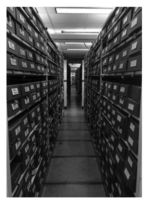
Vista half mile

shelving units, within ranges, and among buildings.