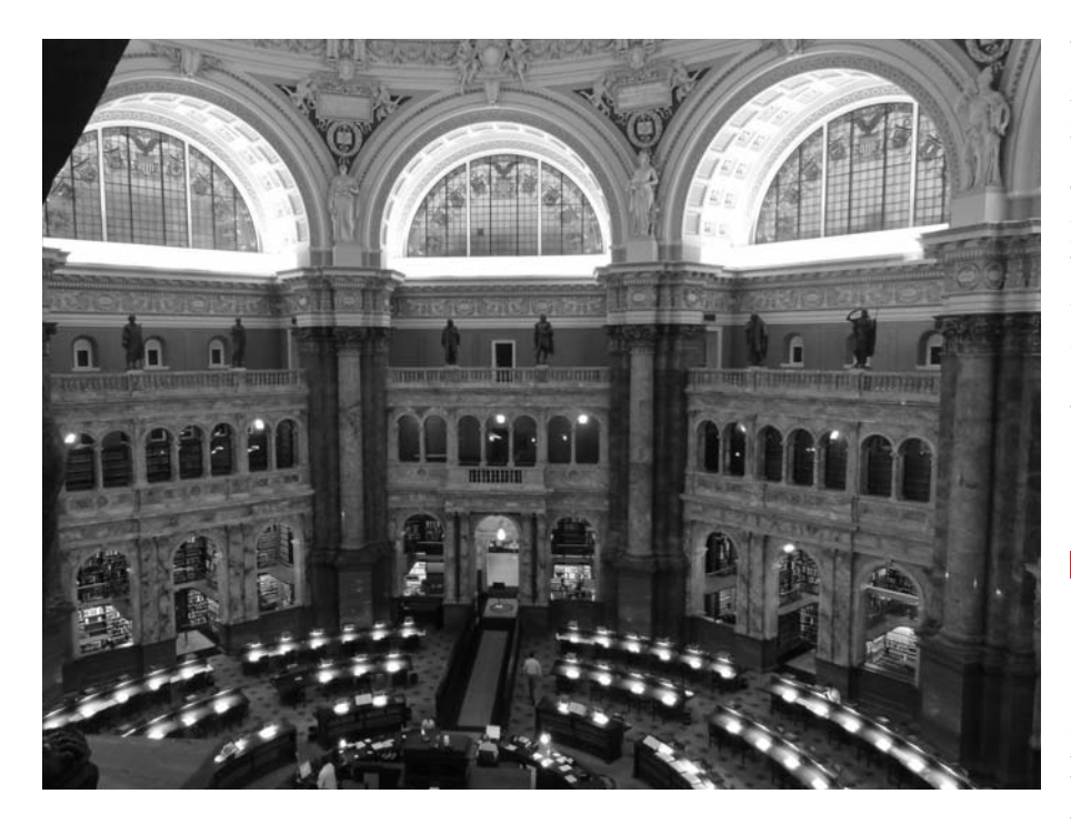
A glance into the reading room of the Library of Congress